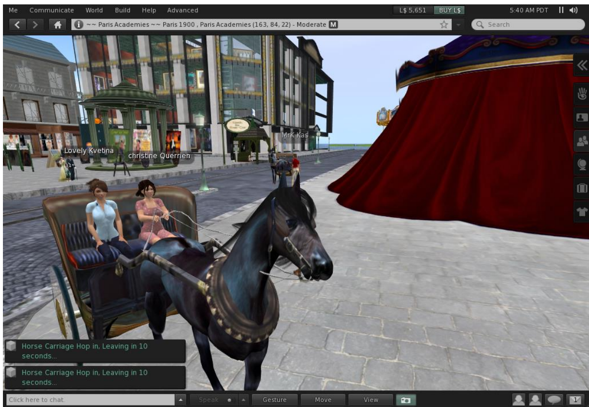
Figure 10. Here the students drive a horse-drawn carriage around the streets of Paris in 1900. Other favorite activities in this simulation were parachuting off the Eiffel tower and participating in the acrobatic circus!

During the workshops, the Global Classroom students expressed a high level of enjoyment using the virtual environment for their language-learning activities.