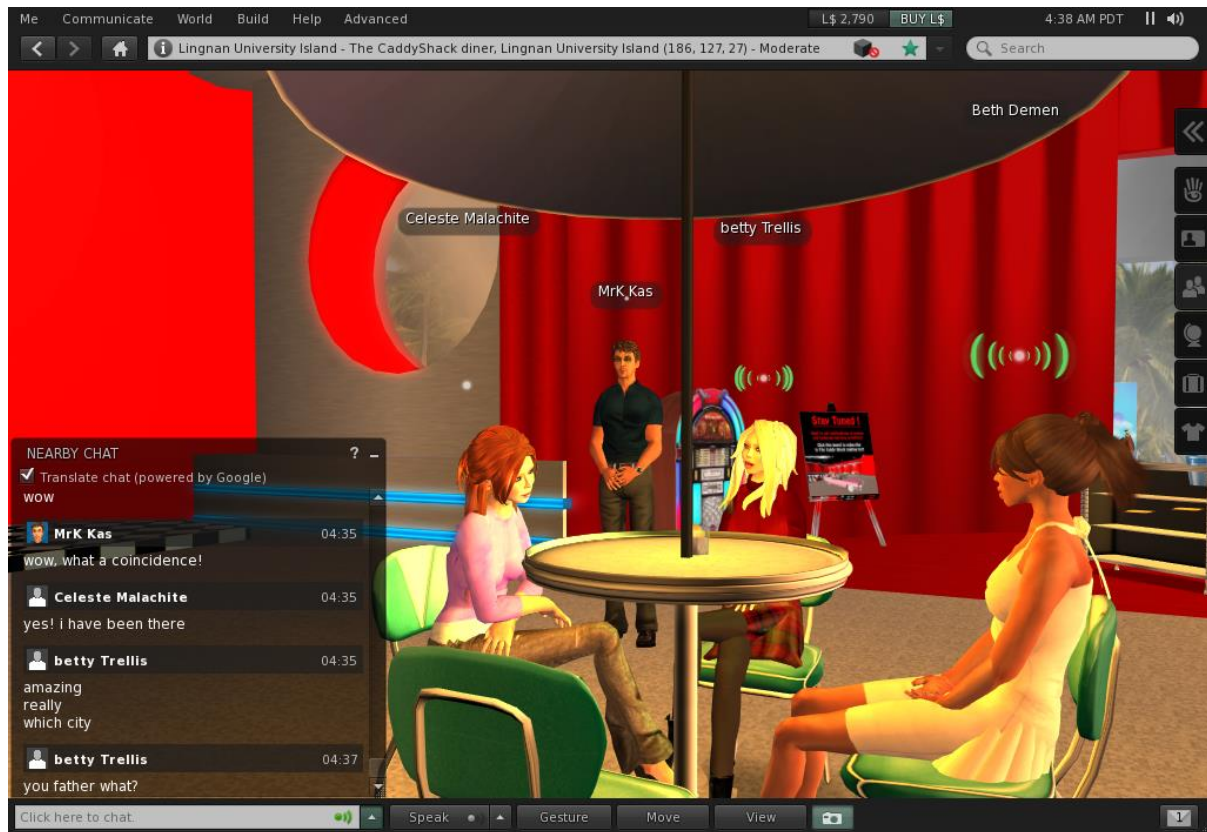
Figure 6. Hong Kong English 101 students using both audio (green arcs above the avatar indicate voice transmission) and chat in a discussion with US TESOL students

The most popular area on Lingnan University Island for individuals to meet and mingle was the facility designed for language-learning: the Caddy Shack. Here the students can simulate the social activities of serving and drinking various beverages, dancing, playing mahjong and billiards. Within the Caddy Shack, the most popular socializing area was the round patio tables near the front door, which each have four chairs under an umbrella (Figure 6). These chairs were the easiest for new users to navigate their avatars towards and then activate the sit function.