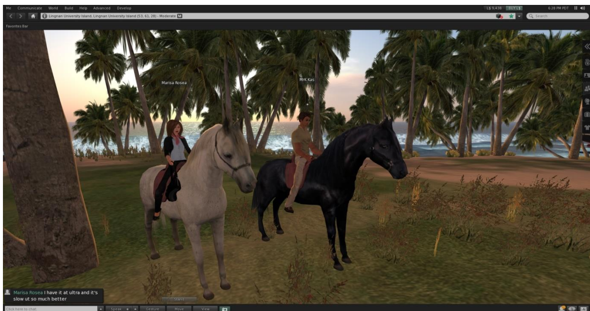
Figure 8. Riding horses is a popular activity on the Lingnan University Island in Second Life.

Other popular meeting areas included the campfires along the beach, and the rainforest simulation. The most popular non-language activities included dancing on the Caddy Shack rotating dance floor, riding the virtual horses in the meadows (Figure 8), and racing the virtual jet skis around the island perimeter. This rich environment offers a wide range of virtual activities to stimulate possible conversational scenarios between language learning partners.