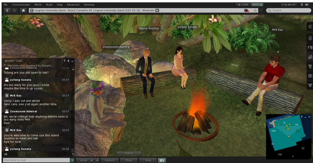
Figure 4. A beachside campfire gives students a quiet place for private chats.

presented a difficult obstacle to regular participation.