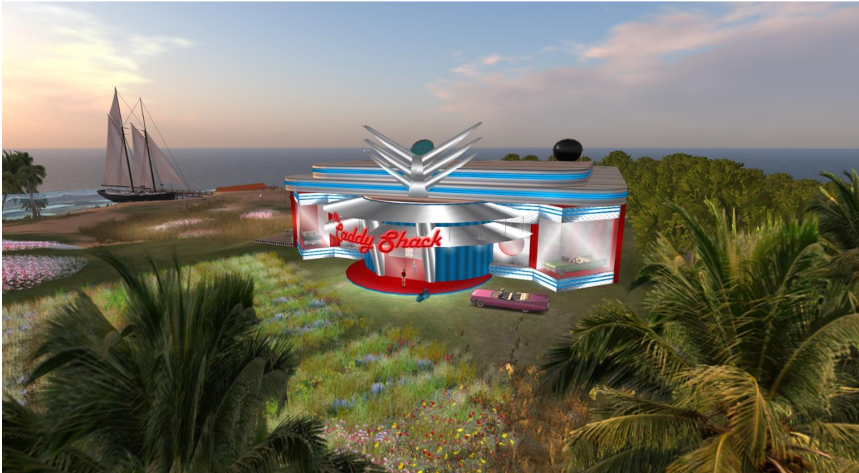
Figure 1. The Caddy Shack diner on Lingnan University Island in the Second Life virtual environment.

It has the look and feel of a 1950's-era American diner, with a large bar and restaurant seating area, rotating dance floor, and 12 classic convertible Cadillac cars (Figure 2).