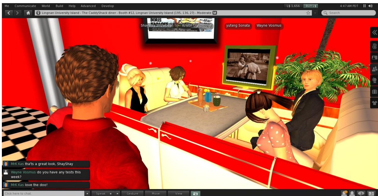
Figure 3. The vintage Philco TVs can display student-selected YouTube video clips which can be viewed by any avatars nearby. Cocktails can be served, and the avatars can simulate drinking the beverage of their choice!

These cars have been modified so that the front seat faces the back, and a diner table inserted between them, to create a conversational "booth" designed to seat 4 avatars (inspired by the Jack Rabbit Slims diner in the movie Pulp Fiction). Selected booths have also been fitted with adjacent TV sets, which can be used to display anything available on the Internet, including YouTube videos, music, artworks, etc, as a tool for stimulating conversational interaction (Figure 3). This display of "shared media" can be controlled and viewed by all of the avatars in the area. The use of shared media requires the Second Life Viewer 2, a second generation application similar in operation to a browser. Each booth has been placed on a land parcel which blocks sounds from entering or leaving, providing protection from outside noise interference (music and other voice conversations), and privacy for those conversing inside. These booths are designed to support voice conversations using the VOIP technology built into SL, which works in a fashion similar to Skype.