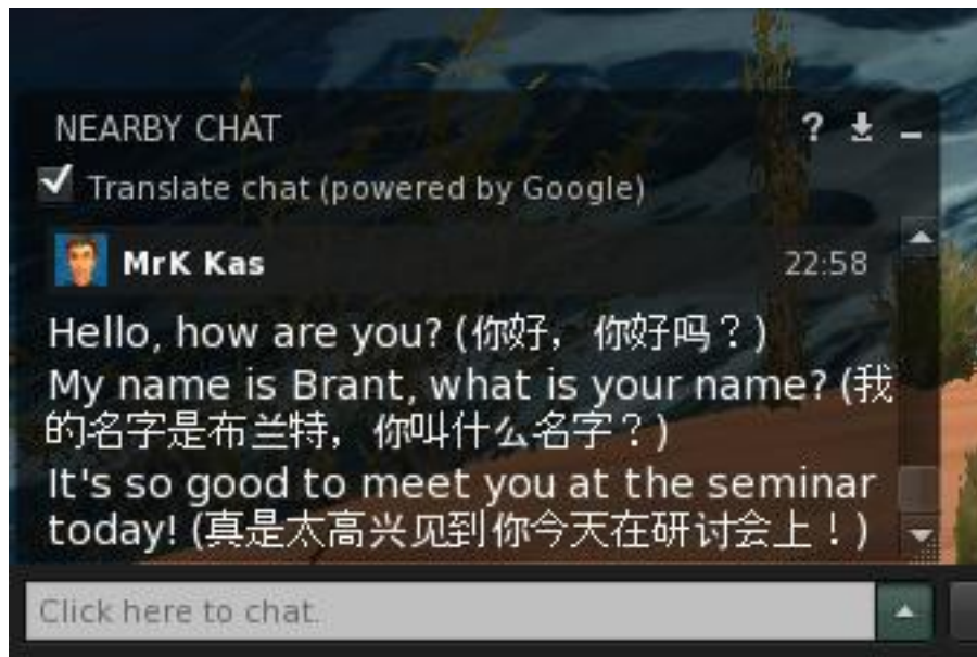
Figure 7. The new automatic machine translation of chat may prove to be a tremendous boon to language learners using the virtual environment.

The Cadillac diner booths (made to resemble classic convertibles) in the Caddy Shack received consistently good feedback for interesting novelty. The students liked the way they achieved acoustic isolation from other Voice users, and the four-seat capability successfully limited the group size to more intimate conversations. New users, however, often encountered difficulty in using camera controls to successfully look down into the car seats and then activate the sit function.